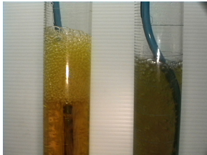
Competition XL-7336 Foam @ 80°C

Oil filters are strongly recommended to ensure the integrity of XL-7336 and extend fluid life in service.